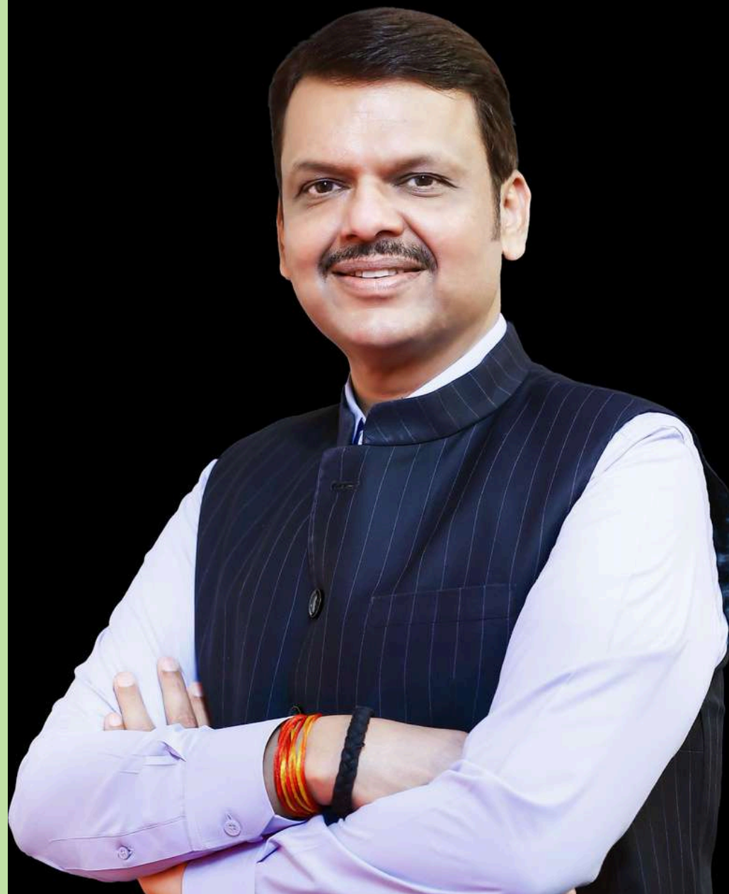
Shri. Devendra Fadnavis Hon'ble Chief Minister of Maharashtra